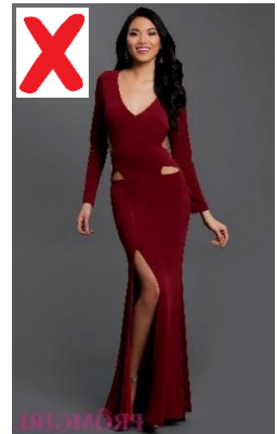
Cleavage, cutouts, slit