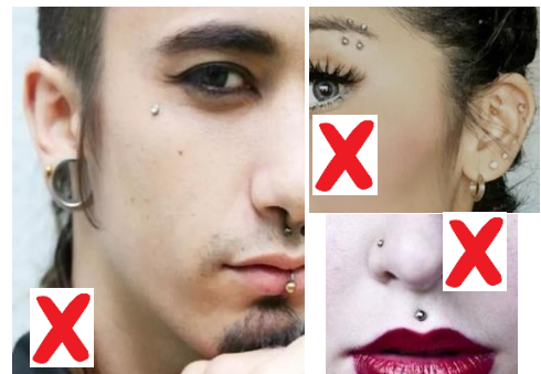
Facial hair. Facial piercings not allowed for any gender. Boys may not wear earrings.