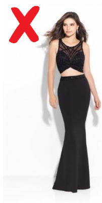
Sleeveless, bare midriff