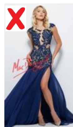
Sheer fabric, high slit