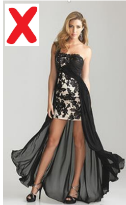
Strapless, too short