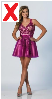
Too short, sleeveless