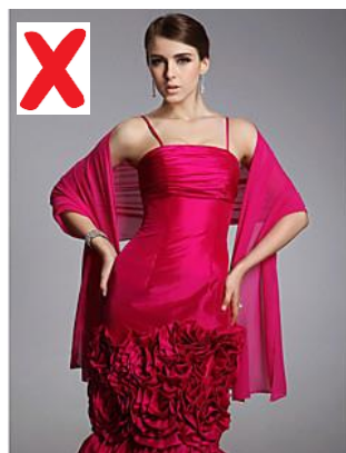
Spaghetti straps; shawl