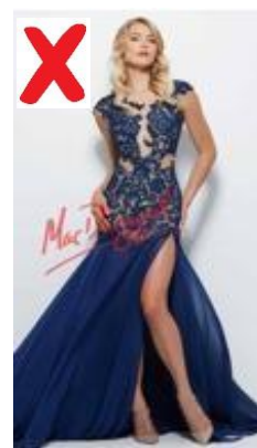
Sheer fabric, high slit