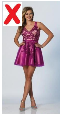
Too short, sleeveless