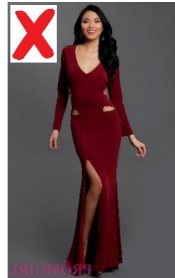
Cleavage, cutouts slit