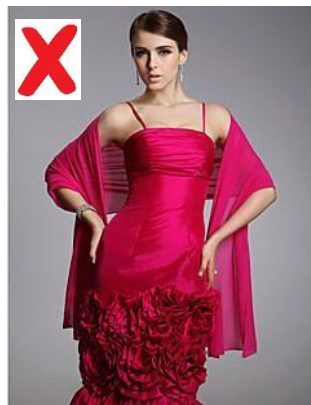
Spaghetti straps; shawl