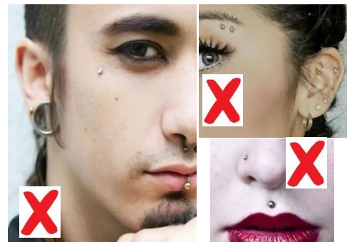
Facial hair. Facial piercings not allowed for any gender. Boys may not wear earrings.