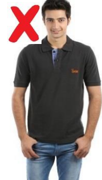
Casual dress, polo shirt